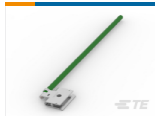
TE Part #2829724-1 CABLE ASSEMBLY, GROUND CLIP 4 INCHES