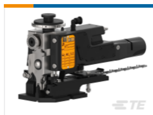
TE Part #2150464-2 OCEAN_2.0_APPLICATOR-E-110F180F