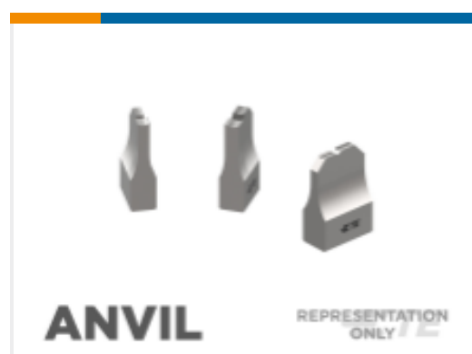
TE Part #1803337-2 ANVIL, COMBINATION