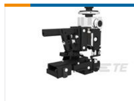
TE Part #2151115-1 OCEAN_2.0_Applicator-S-062F110F