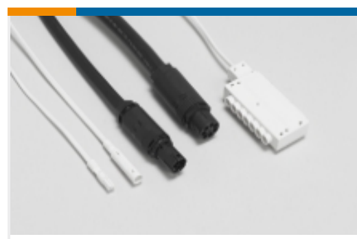
Lighting Cable Assemblies(1)