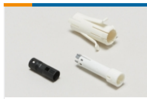
Plug &amp; Socket Lighting Connector Accessories(57)