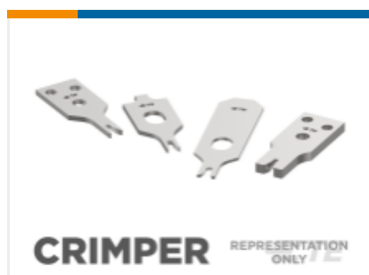
TE Part #1803323-9 CRIMPER, WIRE, F PREMIUM