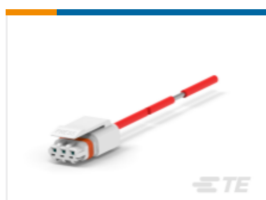
TE Part #7-2834182-2 1P,PLUG CABLE ASSY-203.2MM, WHITE,TIN