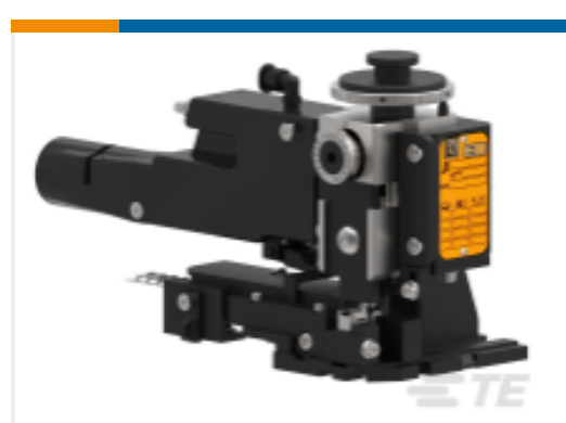
TE Part #2266508-2 OCEAN_2.0_Applicator-S-070F1200A