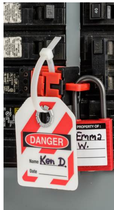
Can be secured with cable ties and/or a safety lock

i Please visit our website www.bradyeurope.com or see page 76 for a selection of tags