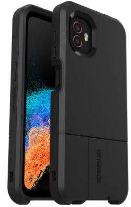
Black 77-90666 (ProPack) 840304707430