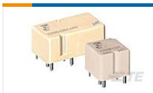
TE Part #1413009-9 V23086C2001A403