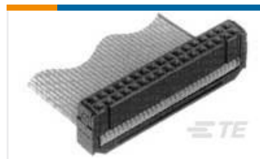
TE Part #1658623-2 14 NOVO MIL 30DP, LEAD FREE