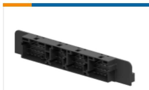
TE Part #828763-1 HIGH PIN COUNT HEADER