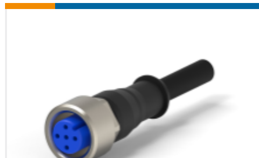
TE Part #1-2273035-1 M12 A-CODE FEMALE STRAIGHT PIGTAIL