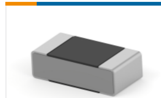
TE Part #1879129-6 RN 0402 1K24 0.1% 10PPM 5K RL