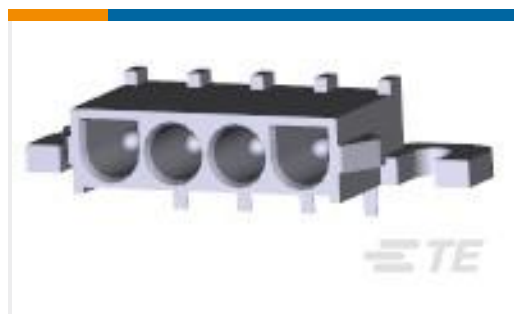
TE Part #1-350944-0 04P UMNL HDR ASSY R/A 94VO