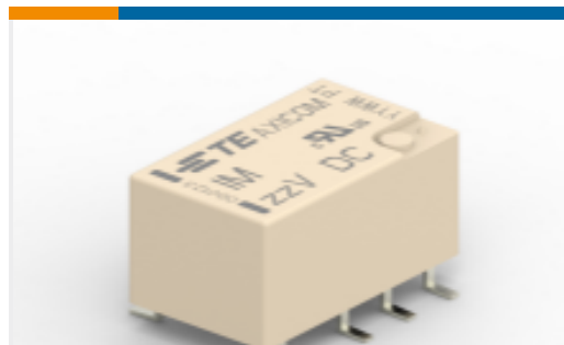
TE Part #1462042-3 Signal Relay: 1 Form C, 1 CO Contacts