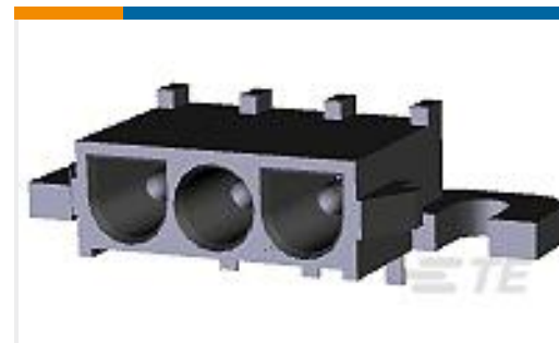
TE Part #1586892-3 03P UMNL HDR ASSY R/A, GW V0