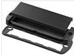
Mounting lid with removable aluminium cap