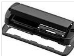
Mounting lid with hinged aluminium flap and compartment for 9V block battery