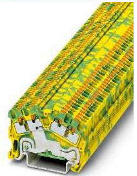
1.5 (1.5) mm 2 , ground terminal block, 4 connections