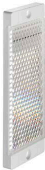
Part no.: 50022815 TKS 50X100 Reflector