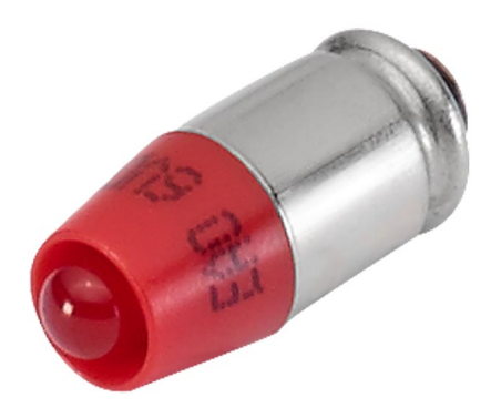
Attention: The preview is based on a sample product. This can differ from your current configuration.