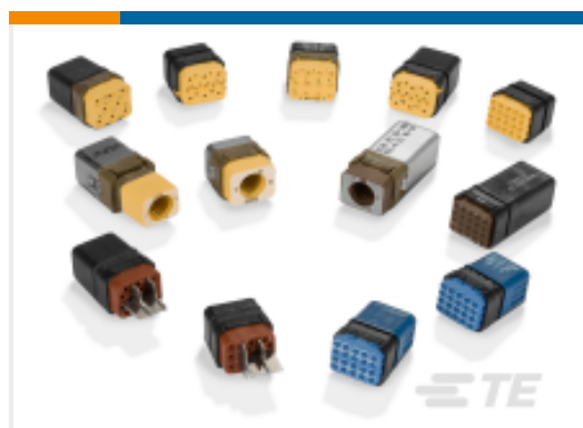
TE Part #ZPF000000000148762 DMC-M 99-04 AN (=33537-P0000)