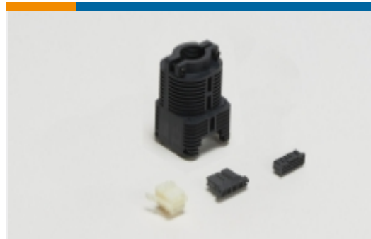
Rectangular Connector Housings(20)