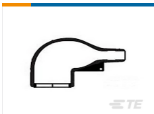
TE Part #EF9981-000 222K121-25L/225-0