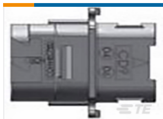
TE Part #ZPF000000000148912 DMC-MD 26 A-T