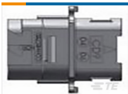
TE Part #ZPF000000000146308 DMC-MD 26 F-K-T