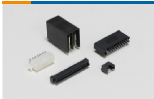
Standard Rectangular Connectors(18)