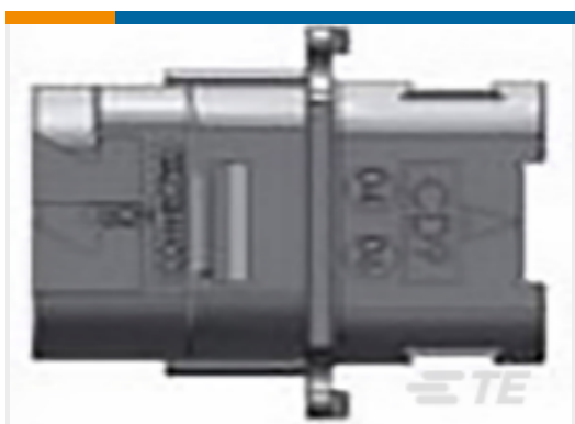
TE Part #ZPF000000000146309 DMC-MD 26 G-K-T