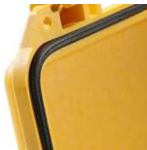
1483 Replacement O-ring