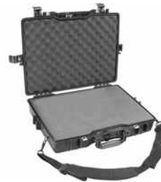
1495WF With Foam