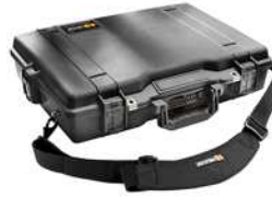
1495NF No Foam