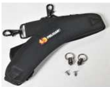
1472 Shoulder Strap