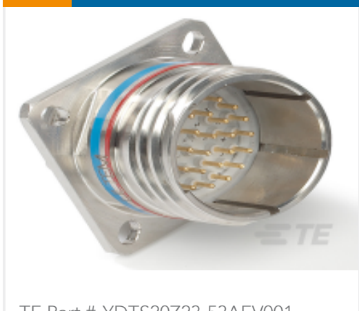
TE Part # YDTS20Z23-53AEV001 RECP ASSY