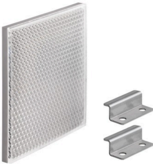
Part no.: 50130290 TK 100 x100-Set Reflector