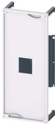
ALPHA 630 DIN, ASSEMBLY KIT F. 3 A. 4-POLE CIRCUIT BREAKER 3VL630, H=600 W=250