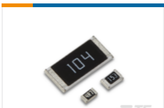
TE Part #1-2176343-3 CRGCQ 1206 100R 1%