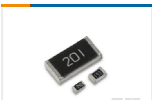
TE Part #2-2176325-8 CRGP 0402 1K8 1%