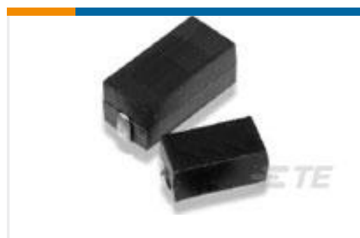
TE Part #2-1879022-9 SMF3 4K7 5%