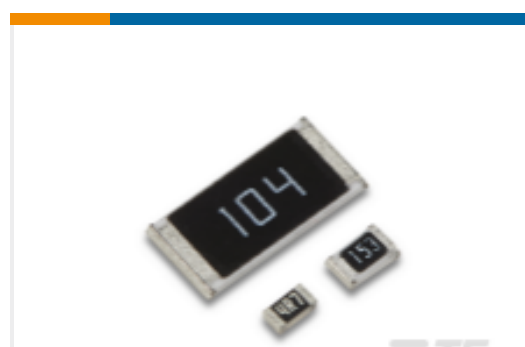
TE Part #2-2176343-5 CRGCQ 1206 1K0 1%