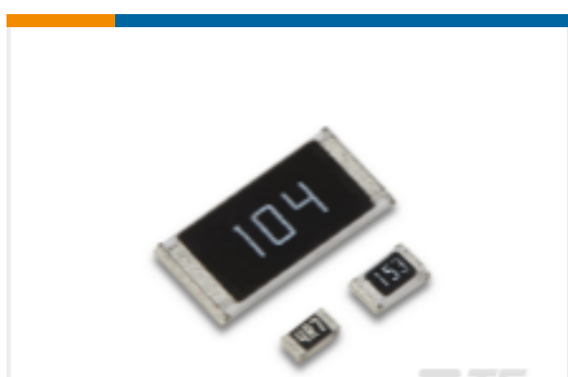
TE Part #3-2176343-5 CRGCQ 1206 6K8 1%