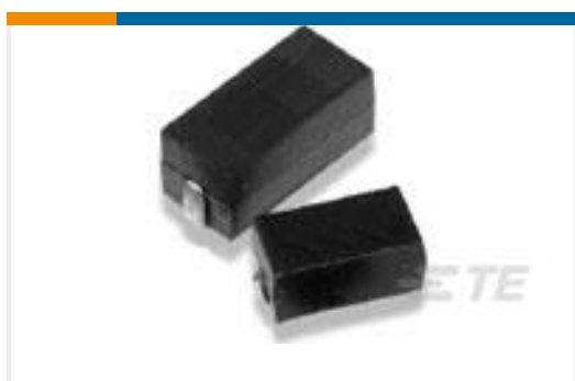
TE Part #6-1879021-5 SMW3 47R 5%