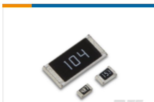
TE Part #3-2176343-3 CRGCQ 1206 4K7 1%