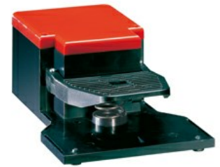
One pedal, with free actuation - open KG100