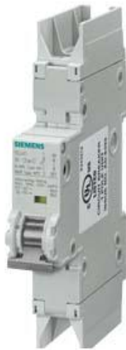
CIRCUIT BREAKER 10KA, 1POLE, C, 25A ACC. TO UL 489 - 277V