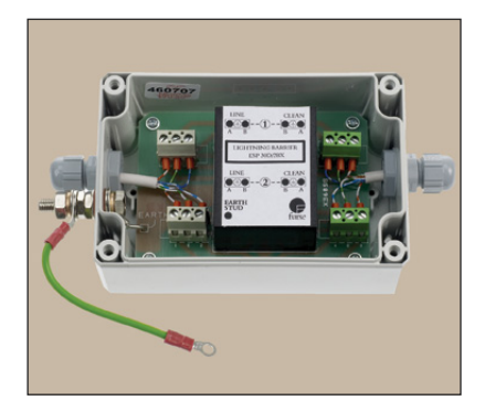
ESP 30D/2BX with lid removed to show internal connections. Note the colour coded, grey and green, terminals