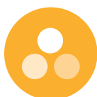
Colour temps 5500K