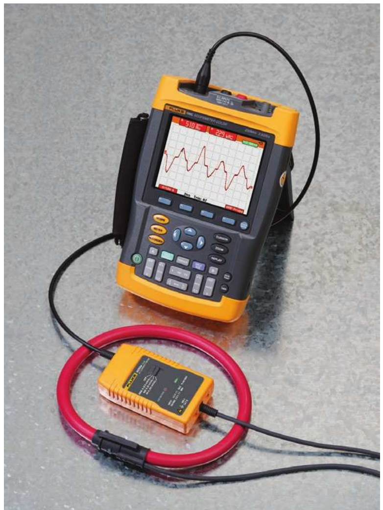
i6000s connected to a Fluke 199C ScopeMeter.