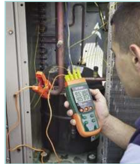
Simultaneously measures 4 temperature inputs for multiple source monitoring