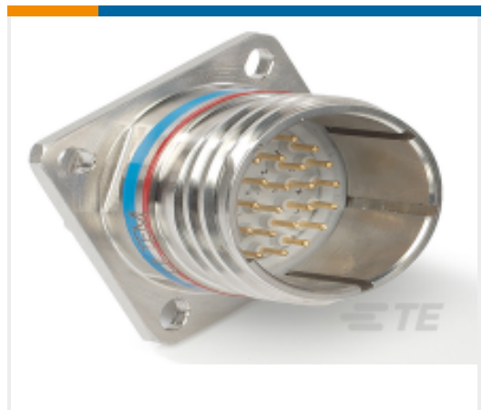
TE Part # YDTS20Z25-19BBV001 RECP ASSY