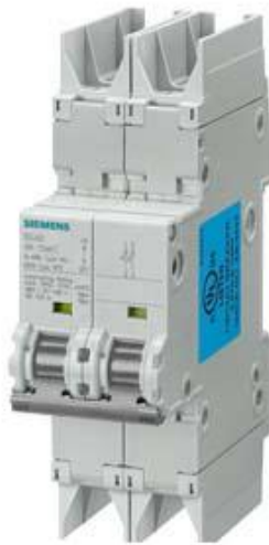
CIRCUIT BREAKER 10KA, 2POLE, C, 15A ACC. TO UL 489 - 480Y/277V