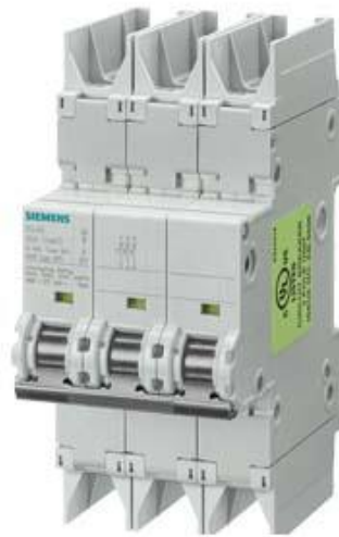
CIRCUIT BREAKER 10KA, 3POLE, D, 2A ACC. TO UL 489 - 480Y/277V