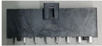
Mega-fit Single row vertical: 200241-11**