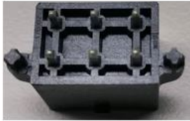
Mega-fit Dual row vertical: 76829/172065