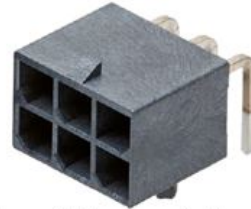
Mega-fit Dual row right angle : 76829/172065