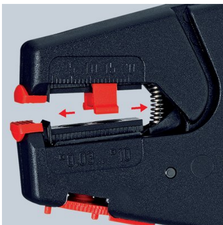
12 40 200: Adjustable length stop