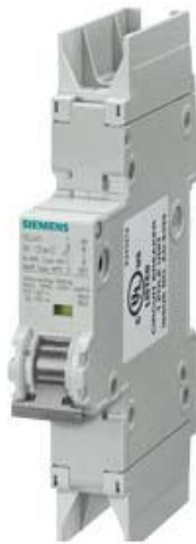
CIRCUIT BREAKER 10KA, 1POLE, D, 13A ACC. TO UL 489 - 277V