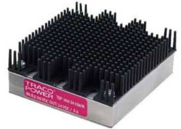
(Models pictured with optional heatsink)

The TEP 160 Series is a family of isolated high performance dc-dc converter modules with wide 2:1 input voltage ranges which come in a rugged, sealed industry standard half brick package.