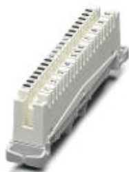
LSA-PLUS disconnect strip to hold the CTM and CT 10 protection modules. Version: 10 double conductors, dimension A: 124 mm.

Please be informed that the data shown in this PDF Document is generated from our Online Catalog. Please find the complete data in the user's documentation. Our General Terms of Use for Downloads are valid ( http://download.phoenixcontact.com )