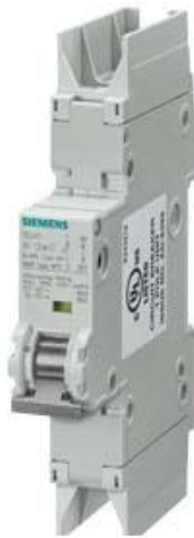
CIRCUIT BREAKER 10KA, 1POLE, D, 32A ACC. TO UL 489 - 277V