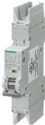
CIRCUIT BREAKER 10KA, 1POLE, C, 40A ACC. TO UL 489 - 277V