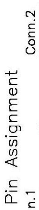
Conn.2 HD15 Male Molding