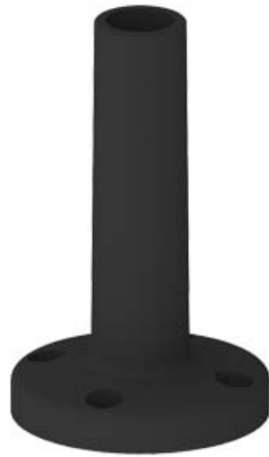
SIGNAL COLUMNS, DIAMETER 70MM ACCESSORIES BASE WITH TUBE (100MM)