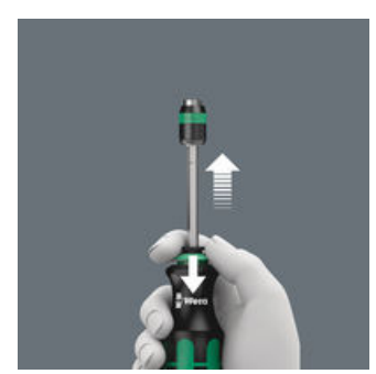
By pushing the clamping sleeve, the telescopic blade can be extended out of the handle and the compact tool becomes a full-sized screwdriver.