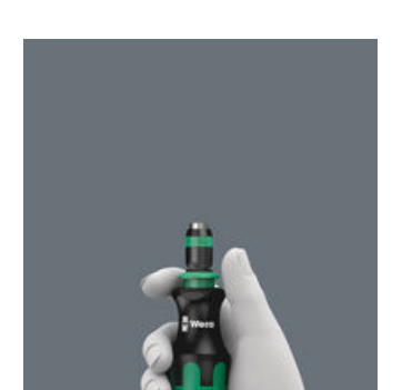
When the unique telescopic blade is lowered into the handle, fast, easy screw-driving action is possible, even in the tightest spots!