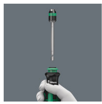
If the clamping sleeve is pushed again the telescopic blade can be taken out of the handle, and be used as a machine bit adaptor.