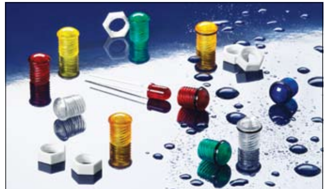
U.S. & Foreign Patents Issued and Pending