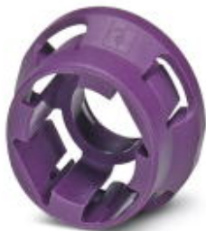
Fixing sleeve for M12 housing screw connection with tolerance-compensating function, for THR solderable M12 socket contact inserts.

Please be informed that the data shown in this PDF Document is generated from our Online Catalog. Please find the complete data in the user's documentation. Our General Terms of Use for Downloads are valid ( http://phoenixcontact.com/download )