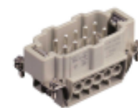
TE Part # T2040102101-000 HE-010-M