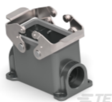
TE Part # T1440101116-000 H10B-SGRS-PG16