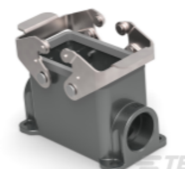
TE Part # T1440101216-000 H10B-SGRS-2PG16