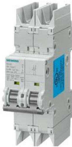
CIRCUIT BREAKER 10KA, 2POLE, D, 5A ACC. TO UL 489 - 480Y/277V