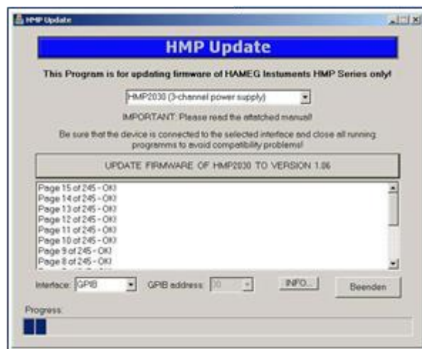
Fig.4: Update currently in process

The unit starts the update process immediately. Do not interrupt the power supply and do not switch off the HMP during update process is running. If the update program seems to be frozen, do not switch off the HMP anyway. The update is then running in the background and take about 10 minutes to succeed.