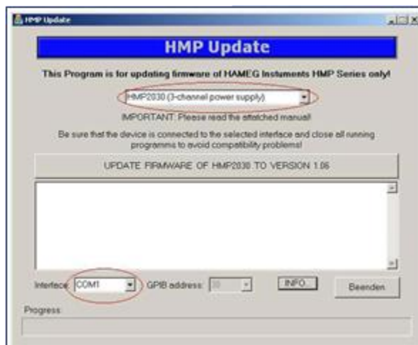
Fig.2: Choosing type of HMP and interface used

Like shown at the next figure, please choose the type of the HMP which you want to update from the pull-down menu in the top half of the program window. Afterwards choose the interface you want to use, COM port or GPIB (last entry in the menu) at the pull-down menu on the left bottom part of the program window.