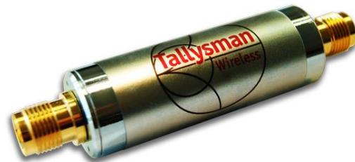
TW120 Dimensions (mm)

The TW120 passes DC directly from input to output to support centre conductor DC supply to the antenna, and so avoiding the need for an additional bias source or bias "T".