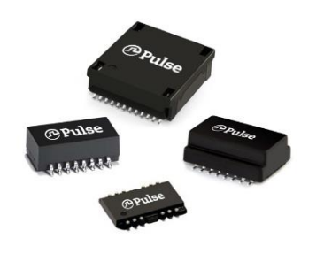
HM-Series Ethernet Transformers

Infotainment, Advanced Driver Assist Systems (ADAS) Body Control, Camera/Radar, Backbone Diagnostics, Gateways