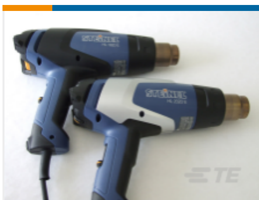
TE Part # EG8162-000 HL1920E-230V-EURO