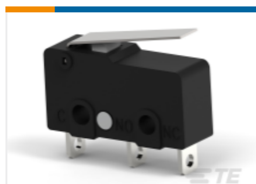
TE Part #2351451-1 SMINSA SW HLV1.47N 5A/3A AC 3A DC SP