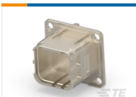
TE Part #ZPF00000000099714 DMC-MD 24 N