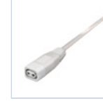
424020006 MAIN POWER L1500 REGLED ECO