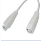
424020009 CONNECTION PLUG 2MT RGL LEDECO