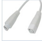
424020005 CONN PLUG 1.5MT RGL LEDECO