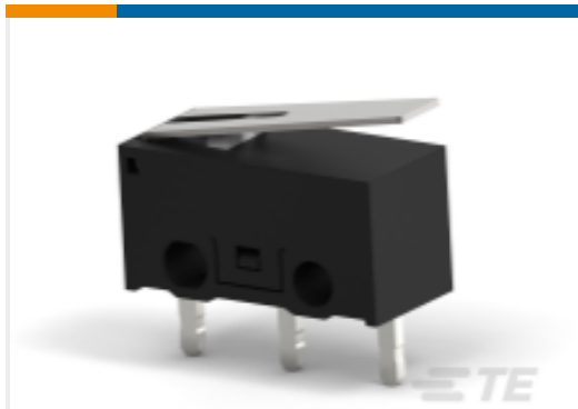
TE Model / Part # 2351445-1 UMINSA SW HLEV 0.74N 0.1A/30VDC SC PCB