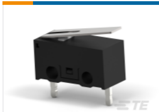
TE Model / Part # 2351445-2 UMINSA SW HLEV 0.74N 0.1A/30VDC NC PCB