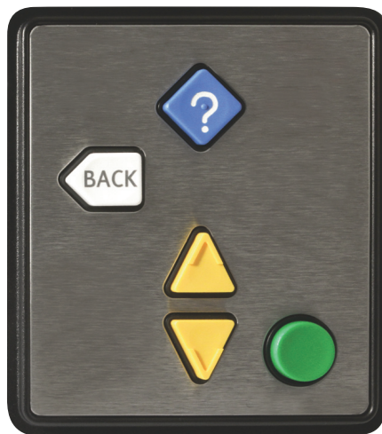
5 Key Layout

Storm Nav-Pad™ keypads are constructed to survive in exposed or hostile outdoor environments the keypads will withstand heavy use and abuse. They are sealed against the ingress of liquids and dust to survive regular wash down and sanitation procedures. Nav-Pad™ keypads feature an optional integral USB interface to ensure hassle free, single cable connection to the host system. (Please note: The USB cable is supplied 'hard-wired').