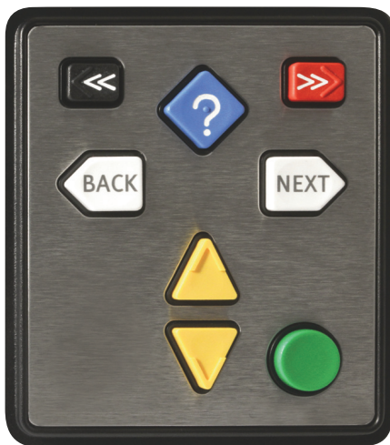
8 Key Layout