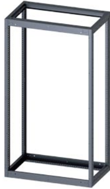
SIVACON, Supporting structure, for standard Empty enclosure, H: 1800 mm, W: 1000 mm, T: 600 mm, zinc-plated