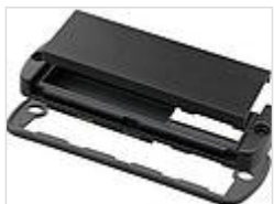
Mounting lid with removable aluminium cap and compartment for 9V block battery