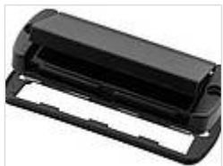
Mounting lid with hinged aluminium flap