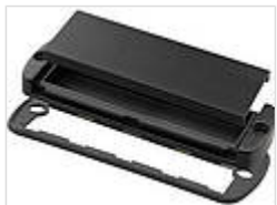
Mounting lid with removable aluminium cap