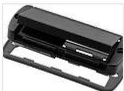
Mounting lid with hinged aluminium flap and compartment for 9V block battery