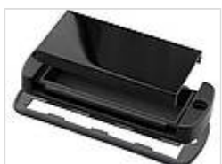
Mounting lid with infrared-permissive plastic cap