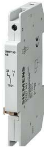
AUXILIARY SWITCH 1CO FOR CYLINDRICAL FUSEHOLDER SIZE 10X38MM/8X32MM