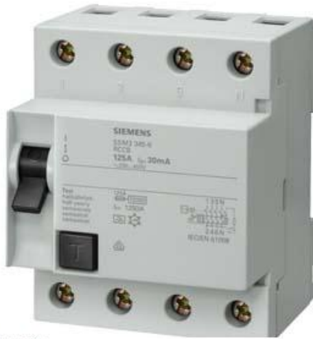
RES.CURRENT OP.CIRCUIT BREAKER TYPE A 125A 3+N-POL IFN 0,5A 400V 4MW