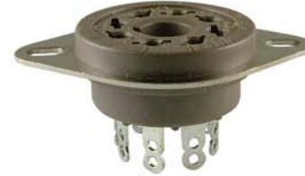
Part Number: P-ST8-209MIP