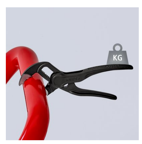
Self-locking and durable – all part of genuine KNIPEX water pump pliers